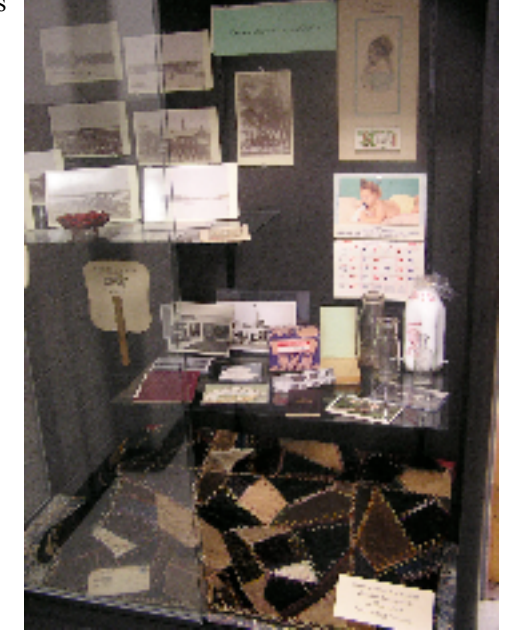
New collection objects at the courthouse office